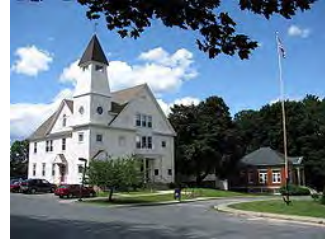
Auburn Town Hall 104 Central Street Auburn, MA 01501